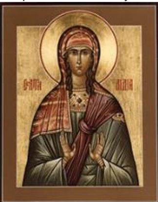
Lidia, Russian icon

As a business woman, Lydia sold purple dye and became very successful – owning her own spacious home with servants. As a convert to Christ, under the teaching of Paul, she continued to work diligently and gave to the new community of Christians through her hospitality and finances. Purple was definitely her colour.