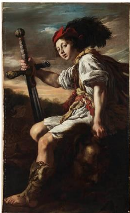
David with the Head of Goliath, Domenico Fetti, c. 1620s

Here's a good time to remember that 'the Lord sees not as man sees: man looks on the outward appearance, but the Lord looks on the heart.' The Lord speaks these words to Samuel before he is directed to anoint David, the youngest and 'ruddy' son who had been keeping the sheep. We can guess he wasn't dressed in his best!