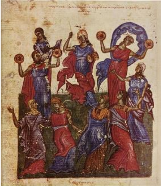
Miriams Tanz, Bulgarischen Tomić Psalter, 1360/63

Miriam the prophetess led the women in dancing and the playing of tambourines after the Israelites exodus from Egypt. She knew how to get the party started.