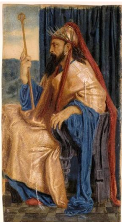
King Solomon, Simeon Solomon, 1874

King Solomon's wealth was much renowned and this verse refers to all the Kings of the age seeking his presence to hear his wisdom. He would have received gifts of silver, gold and fine garments so he was probably the 'best dressed' in all our list. However, keep in mind Jesus' levelling word in Matthew 6:28-30.