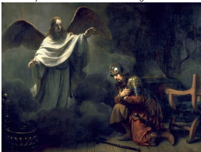
Vision of Cornelius the Centurion, Gerbrand van den Eeckhout, 1664, Source: Wikimedia Commons

Rocking an uber-masculine look in military attire Cornelius the Centurion's fashion sense is only bested by his faithfulness in following Christ.