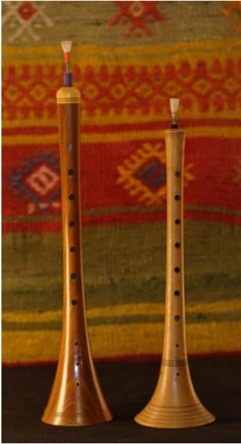
Two zournas, Jean-Xavier Bardant, 2006, Source: Wikimedia Commons

Reed-Pipes were a type of woodwind instrument that were often used in celebrations.