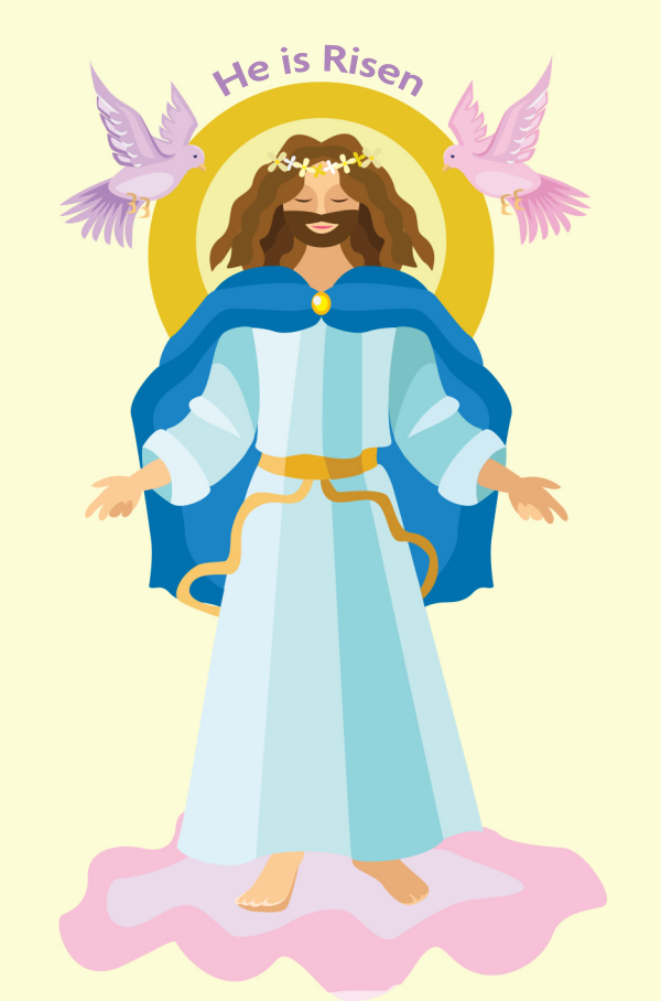
Easter Sunday Mark 16