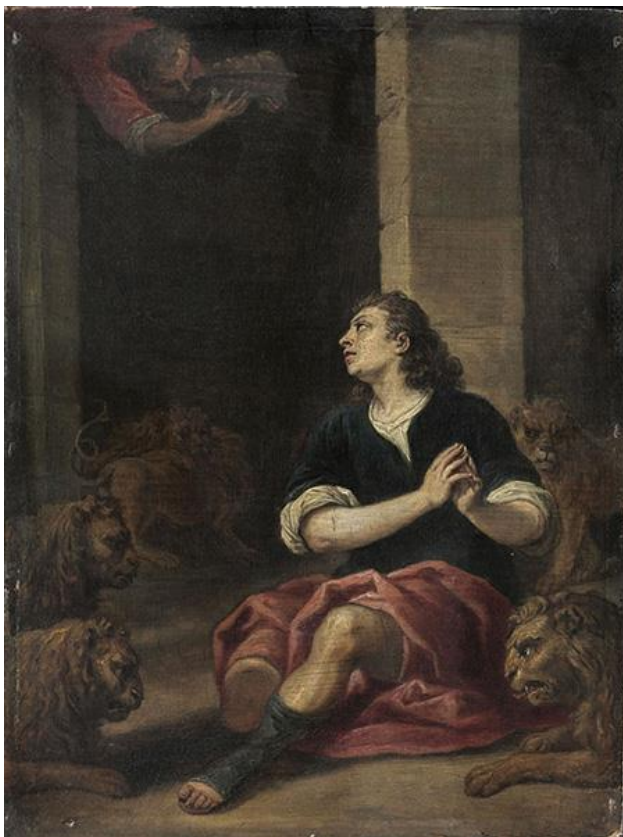
Daniel in the Lion's Den, David Teniers the Younger, c. 1655-1656

An angel shuts the lions' mouths: Daniel 6:16-22