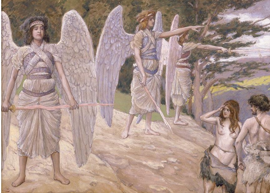
Adam and Eve Driven From Paradise, James Jacques Joseph Tissot, c. 1896-1902