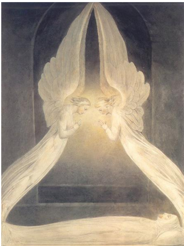
Christ in the Sepulchre, William Blake, c. 1805

Angels inside Jesus' tomb: John 20:11-17