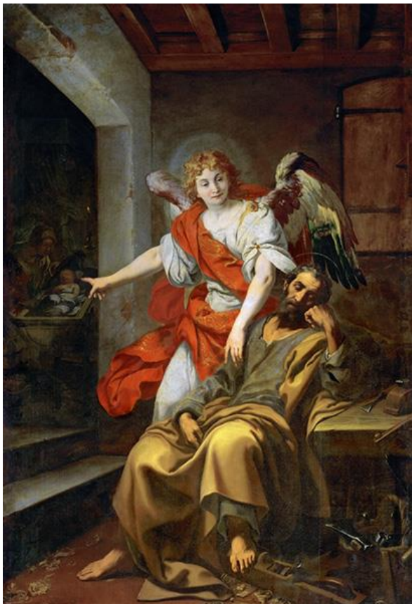
Joseph's dream, Daniele Crespi, c. 1620-1630