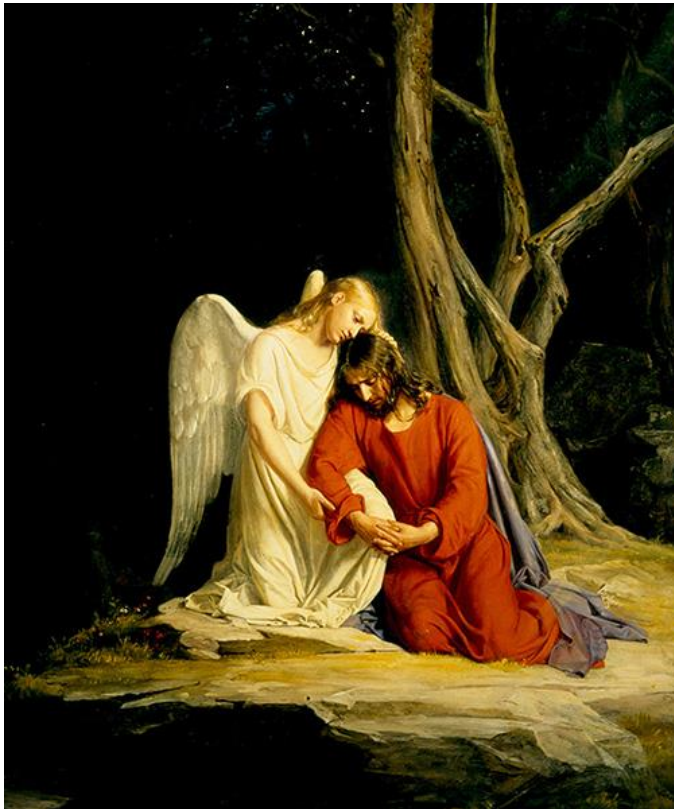
An angel comforting Jesus before his arrest in the Garden of Gethsemane, Carl Bloch, 1873, Source: WikiArt

An angel comforts Jesus in the Garden of Gethsemane: Luke 22:41-45