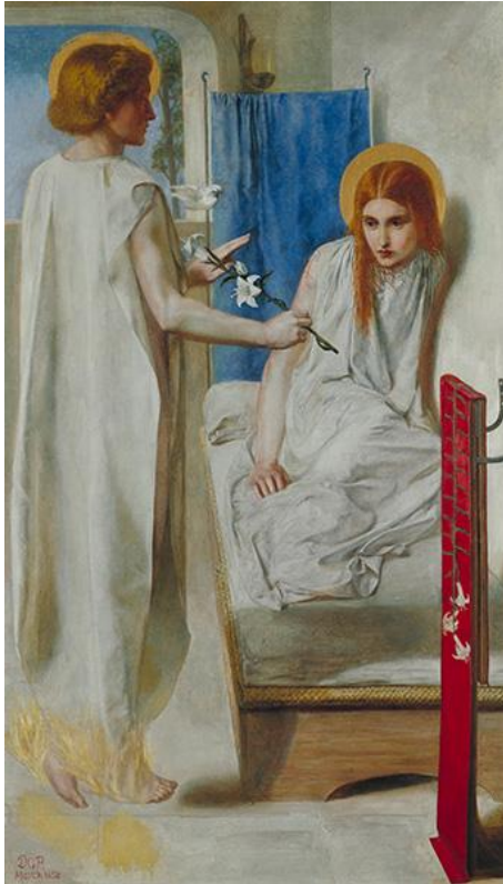
The Annunciation, Dante Gabriel Rossetti, circa 1849