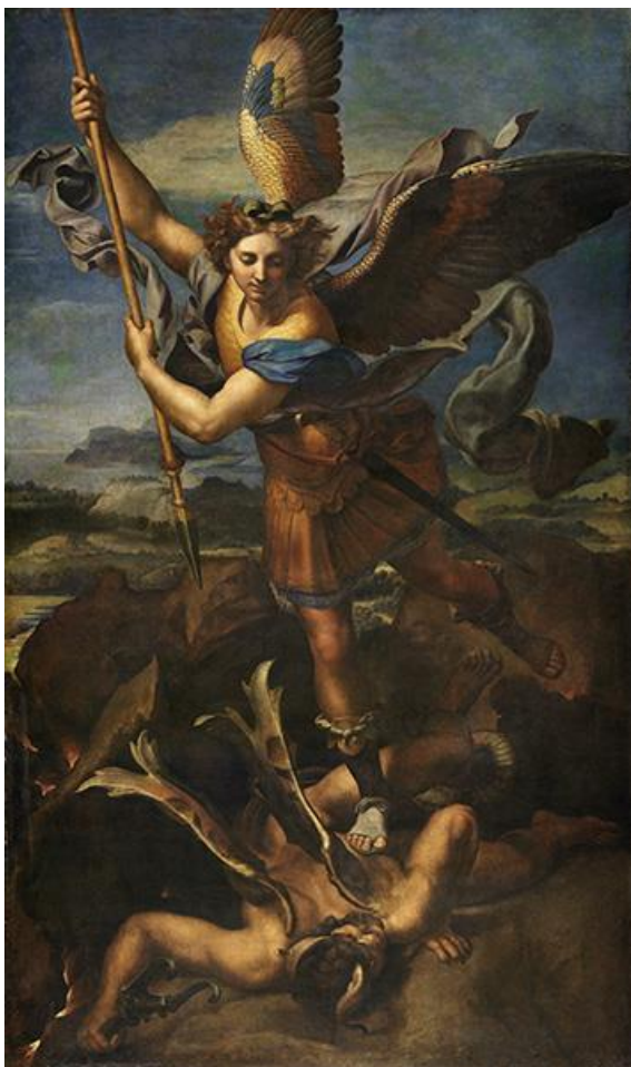
St. Michael Vanquishing Satan, Raphael, 1518