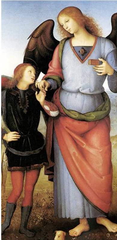
Archangel Raphael with Tobias, Pietro Perugino, c. 1496-1500

Archangel Raphael discloses his identity: Tobit 12:11-22