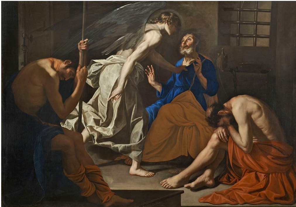
The Liberation of St. Peter, Antonio de Bellis, c. 1640