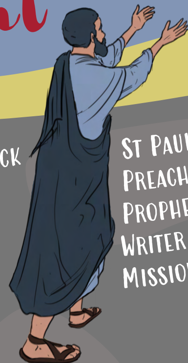
ST PAUL - PREACHER, PROPHET, WRITER AND MISSIONARY