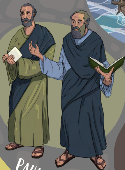
PAUL & TYCHICUS