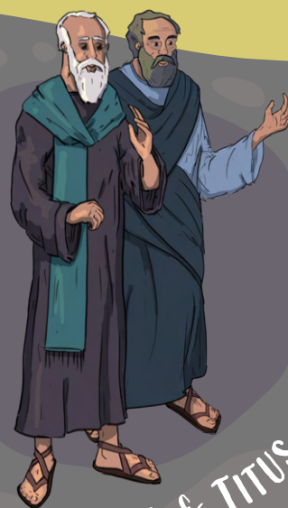
PAUL & TITUS