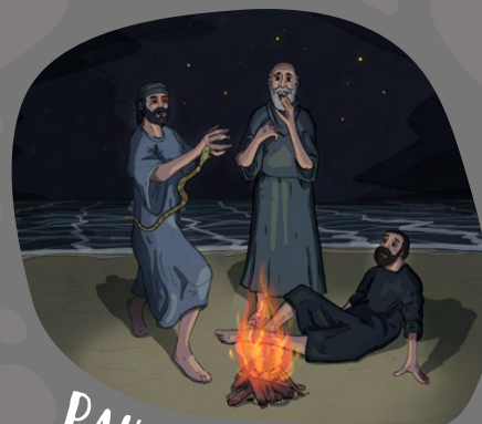
PAUL THE PROPHET