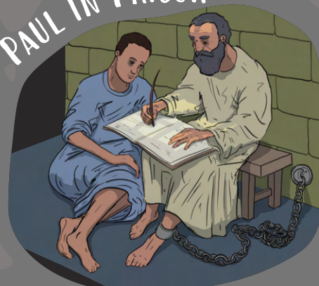
PAUL IN PRISON