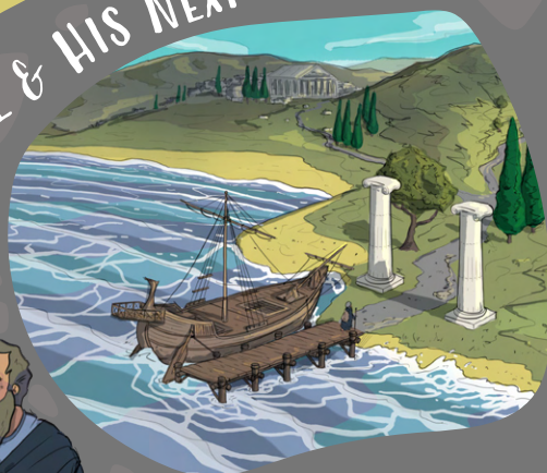
PAUL & HIS NEXT MISSION