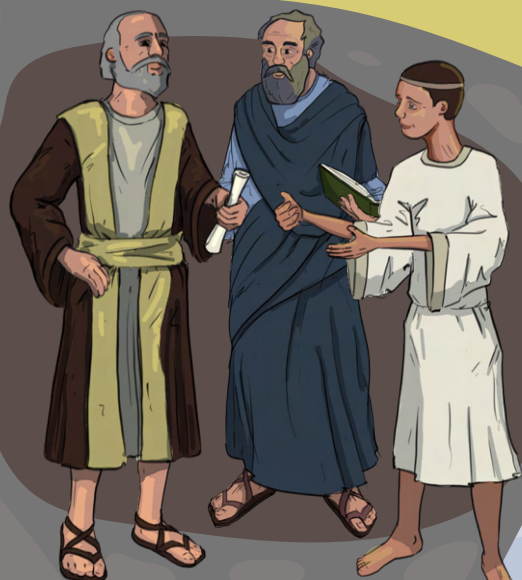
PAUL, PHILEMON & ONESIMUS