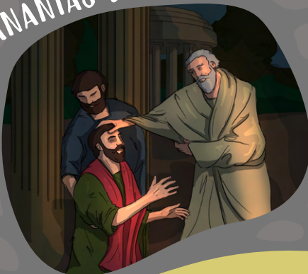
ANANIAS BAPTISES PAUL