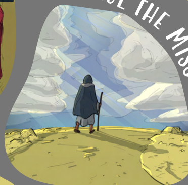
PAUL THE MISSIONARY