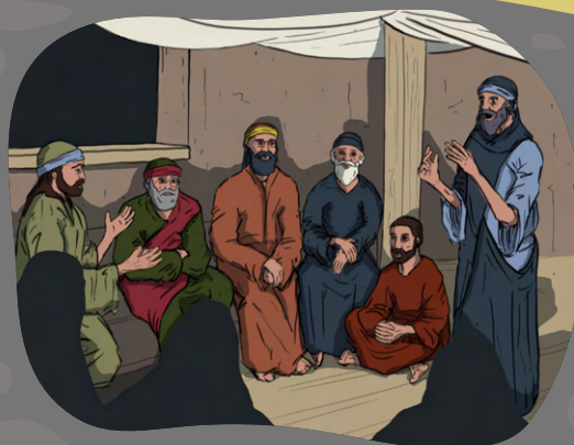
PAUL AND THE GENTILES